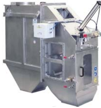
Model 12 Pneumatically Actuated Face Seal Agglomerate Catcher

The agglomerate catcher is bolted to the dryer inlet and is designed to catch and discard oversized pellet clusters (agglomerates) before they enter the dryer rotor. Constructed of 304L stainless steel, the agglomerate catcher includes an inclined grate and a gasketed door for access for cleaning. It is manually operated or pneumatically actuated, depending on the size of the dryer and the system requirements. The agglomerate catcher is an option to all Gala centrifugal dryers.