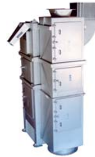
Model 100 High-Capacity Dryer