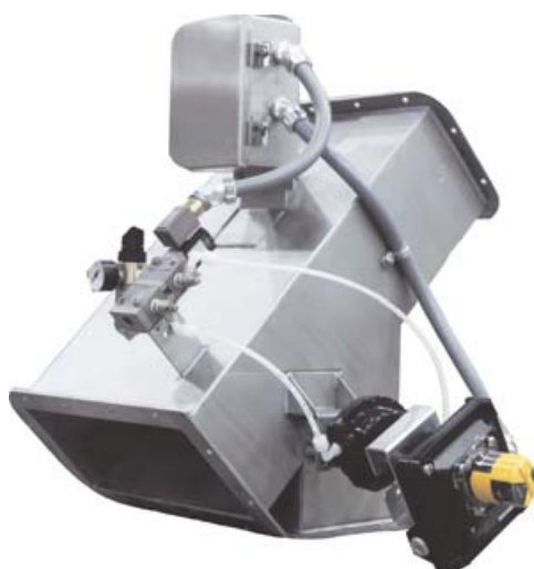
Pneumatically Actuated Pellet Diverter Valve

HMA Rotor: designed specifically for hot-melt adhesives or tacky product applications