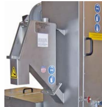
Model 4 Manually Operated Agglomerate Catcher