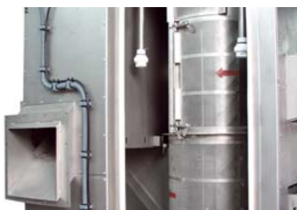
Model 2016 Self-Cleaning