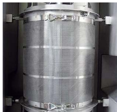
Easy Mount (EM) Screen

The perforated dryer screens have been improved to be more operator friendly and easier to assemble and disassemble by using belt straps around the screens. These new Easy Mount (EM) screens are available for any application, up to 16 Series dryer, requiring frequent cleaning, as well as heavy-wear applications, such as underwater pelletizing and drying of glass-fiber-filled compounds. These screens are being utilized in field operations in various applications and have proven to be leak free, fast to install and remove, and easy to clean.