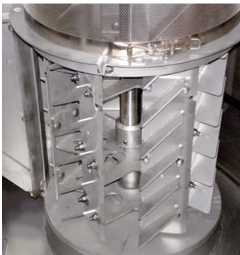
Rotor area of a 2016 BF Dryer