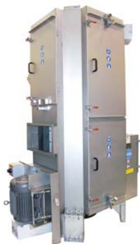
Model 4032BF Easy Access Dryer