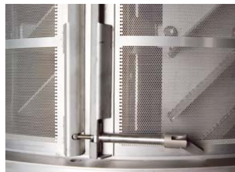
Perforated Screen used for most dryer applications

The screens are an integral part of the centrifugal dryer and serve to retain the pellets in the rotor area as they travel up the rotor to the resin outlet. The surface moisture escapes through the screen openings and drains back into the process water tank. The type of screen used depends on the product and specifications – from the typical perforated screens used for most applications to special-application screens such as Wedgewire for added strength and durability or Expando and ML (multilayer) screens primarily used for micropellet production.