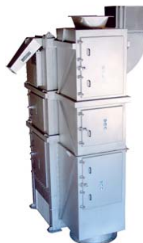
Model 100 High Capacity Dryer