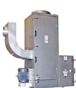
Model 3016 ECLN BF