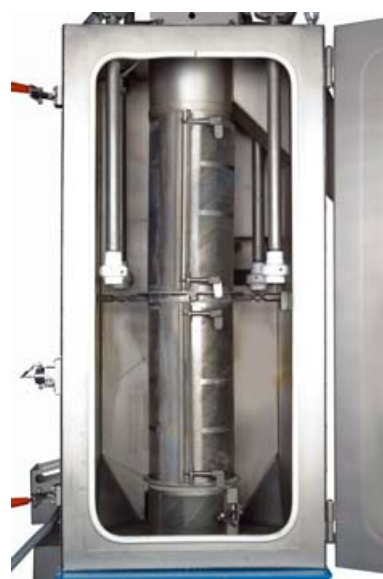
Model 2008 Self-Cleaning Dryer