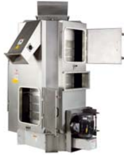
Model 3032DW Easy Access

Easy Access Models: The noise level of an Easy Access Dryer is 95 dBA or less at 1 meter processing 3 mm diameter x 3 mm long LDPE pellets and the buyer insulating the pellet outlet and air outlet lines. This can be reduced to 87 dBA or less with optional low-noise modifications. (Please note that larger and/or harder pellets will adversely affect the noise level.)