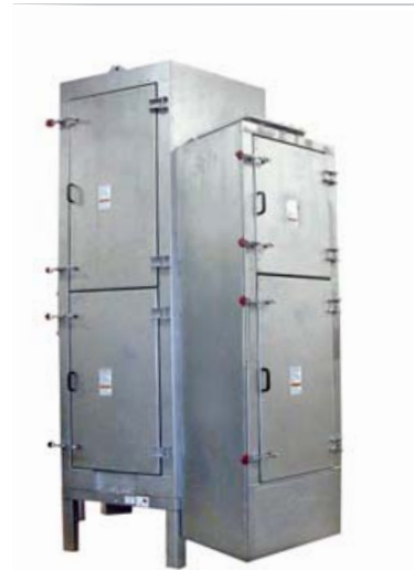
Model 48.5 DW ECLN Dryer